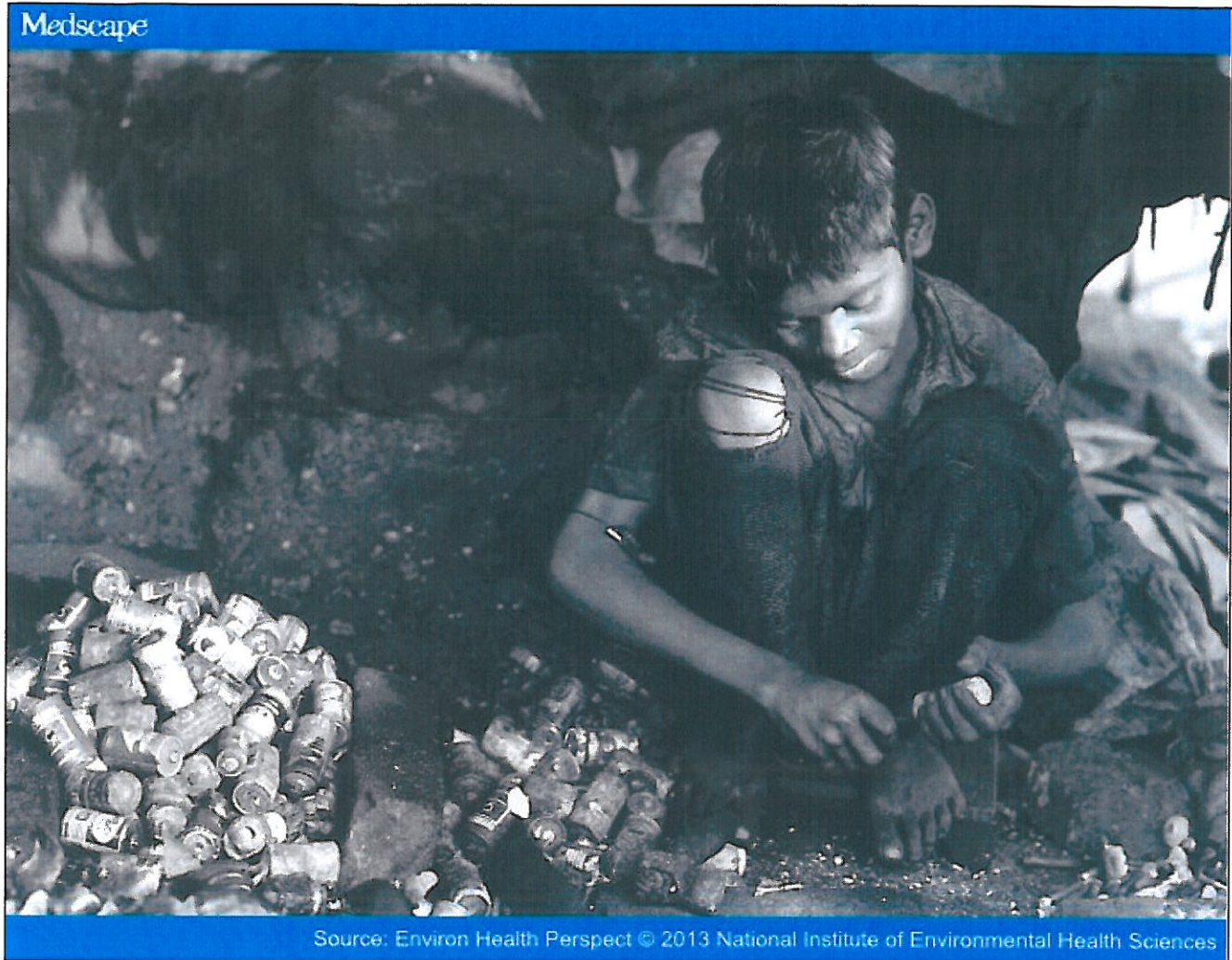
A Calcutta child working in a battery recycling shop. Shops like this are common in some developing countries—and a common source of lead exposure prior to emigration.